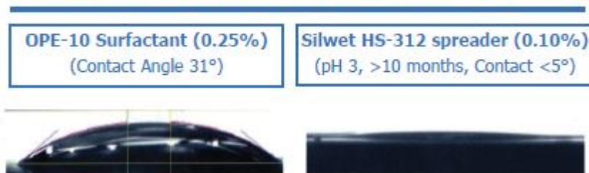
Figure 1: Contact Angles of Spreader Adjuvants

Because the Silwet HS-312 spreader has very low surface tension, the contact angle of spray solutions on leaf surfaces is reduced compared to other surfactant adjuvants. This important property is shown in Figure 1 below, which illustrates Silwet HS-312 spreader having less than 5° contact angle relative to the Octylphenol Ethoxylate containing 10 EO units (OPE-10), having a 31° contact angle. It is also important to note that the lower Silwet HS-312 spreader contact angle is achieved at much lower concentrations compared to the OPE-10 surfactant concentration.