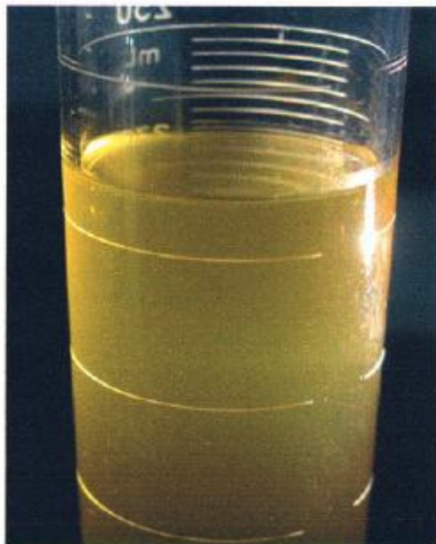
Figure 2: SAG 1572 silicone antifoam emulsion at 0.3% use level in a non-ionic spray adjuvant formulation.